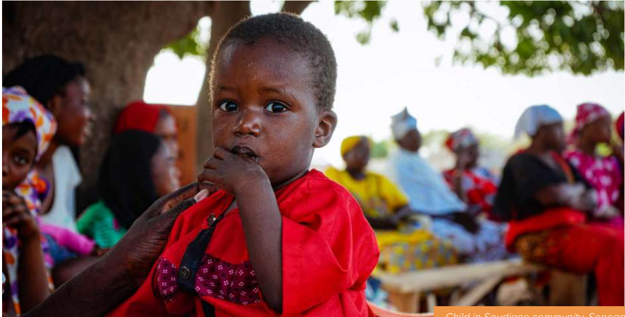
Child in Soudiane community, Senegal