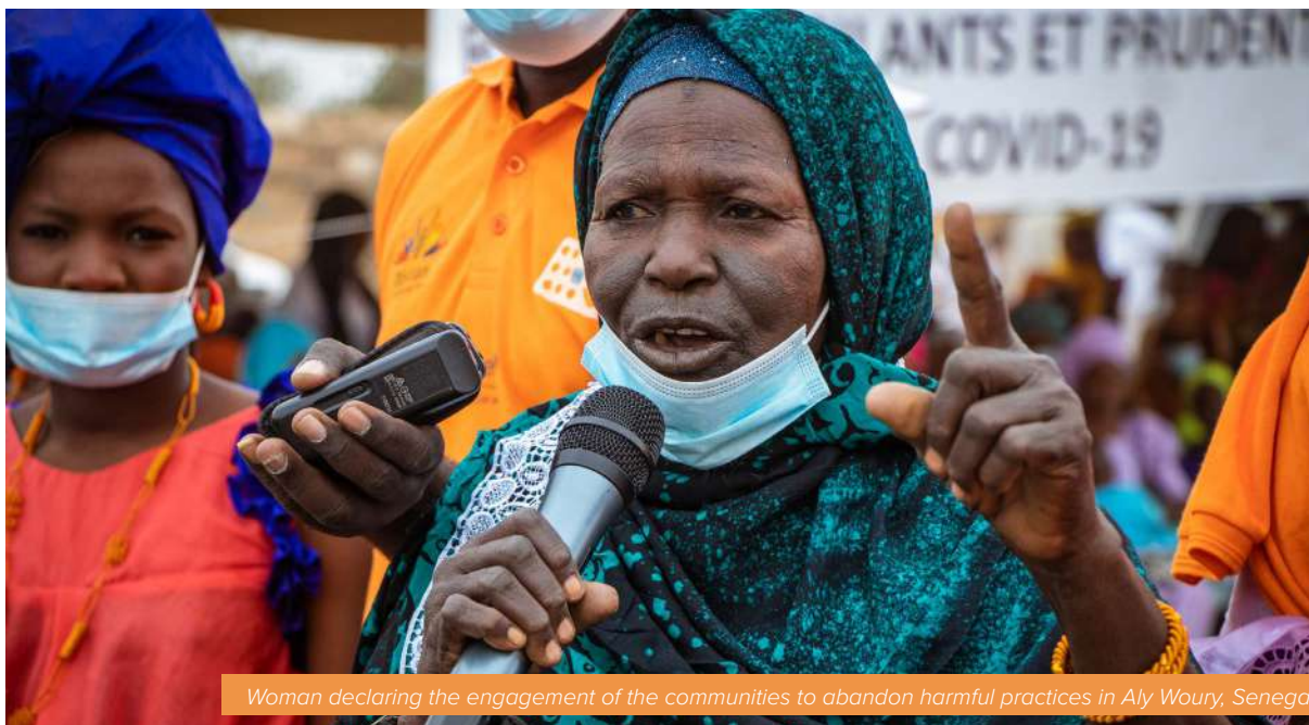
Woman declaring the engagement of the communities to abandon harmful practices in Aly Woury, Senegal