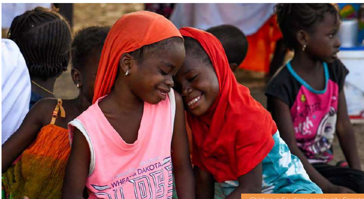
Children in Soudiane community, Senegal

As a part of its commitment to transparency, Tostan publishes comprehensive financial records and data on its website as soon as they are finalized. Please visit tostan.org/publications to read our Audited Annual Financial Statements and our Annual Form 990 submission.