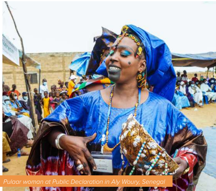
Pulaar woman at Public Declaration in Aly Woury, Senegal

Tostan's empowering education model is in constant evolution and innovation, over time leading to a broader and more holistic program. In 2021, highlights include Tostan's most recent innovation to the CEP—the module on Strengthening Democracy and Civic Engagement (SDCE), as well as Tostan's economic empowerment program, offering hope to communities impacted by COVID-19. New partnerships are providing opportunities to adapt and integrate further content into Tostan's Reinforcement of Parental Practices module and Tostan's fistula prevention and treatment program.