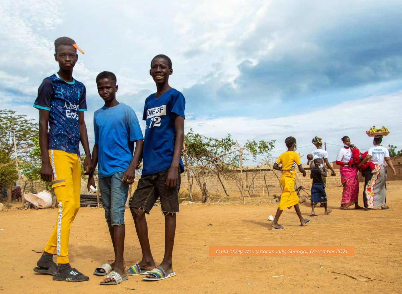
Youth of Aly Woury community, Senegal, December 2021

Tostan has re-launched its fistula program to promote fistula-free regions first in Senegal, and then in The Gambia and Guinea Bissau. Building on Tostan's experience from 2012 to 2016, which integrated classes within the CEP and supported over 100 women living with fistula to undergo surgery, this new program, in partnership with Operation Fistula, will develop a holistic, replicable model to create an effective system that can support identification, treatment, monitoring, and rehabilitation of fistula patients on an ongoing basis.