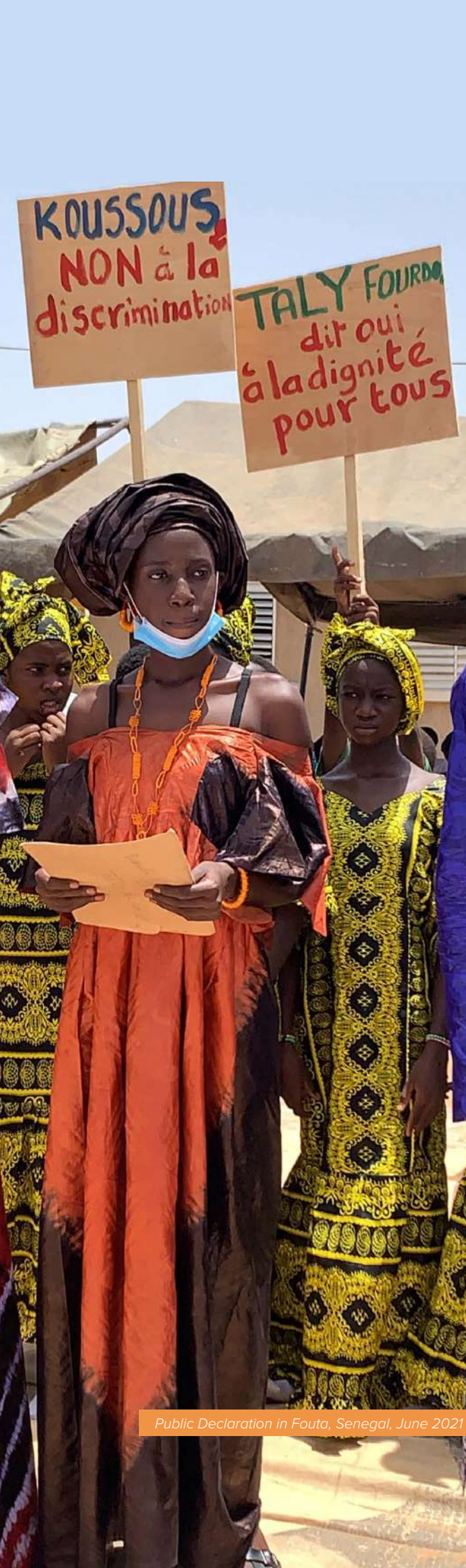
Public Declaration in Fouta, Senegal, June 2021